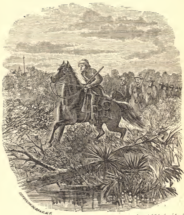
OUR SCOUT, With his brave men, approaching Hagerstown.