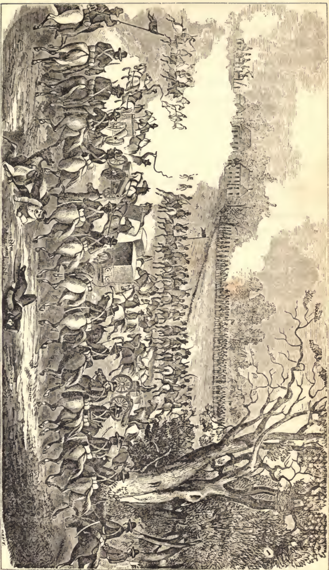
KIPATRICK'S GRAND CHARGE AT BRANDY STATION, VA., OCTOBER 11TH, 1863.