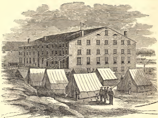
LIBBY PRISON, RICHMOND, VA.