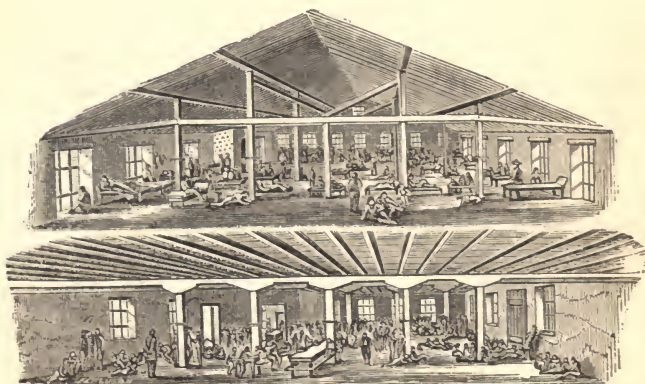
INTERIOR VIEW OF LIBBY PRISON.